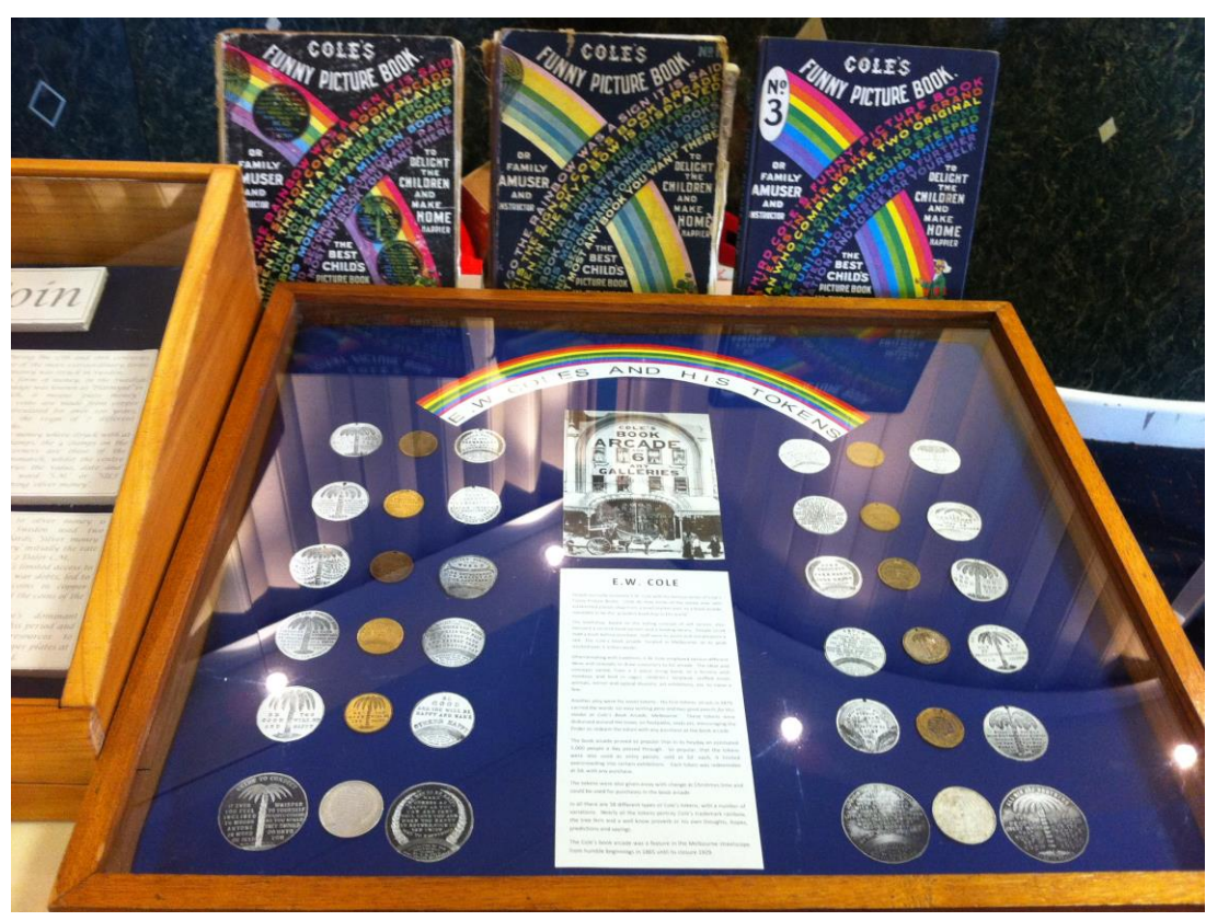
A display of E W Coles Tokens