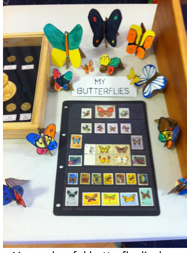
Very colourful butterfly display