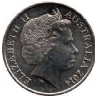
by Ian Rank-Broadley (1999 – 2015?)