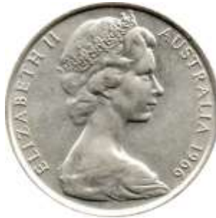
by Arnold Machin (1966 – 1984)