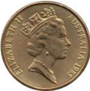
by Raphael Maklouf (1985 – 1998)