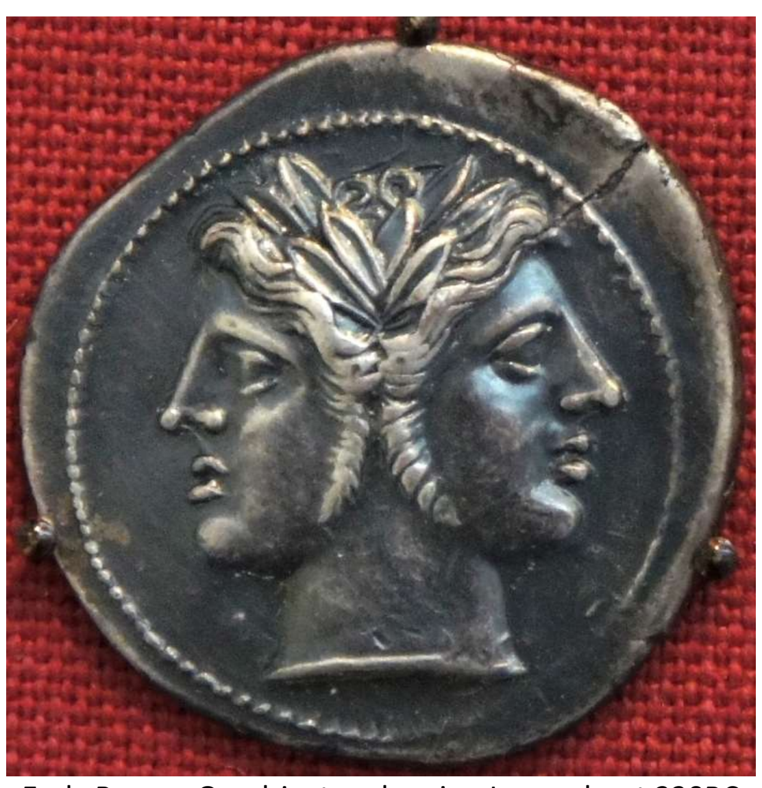
Early Roman Quadrigatus showing Janus about 230BC