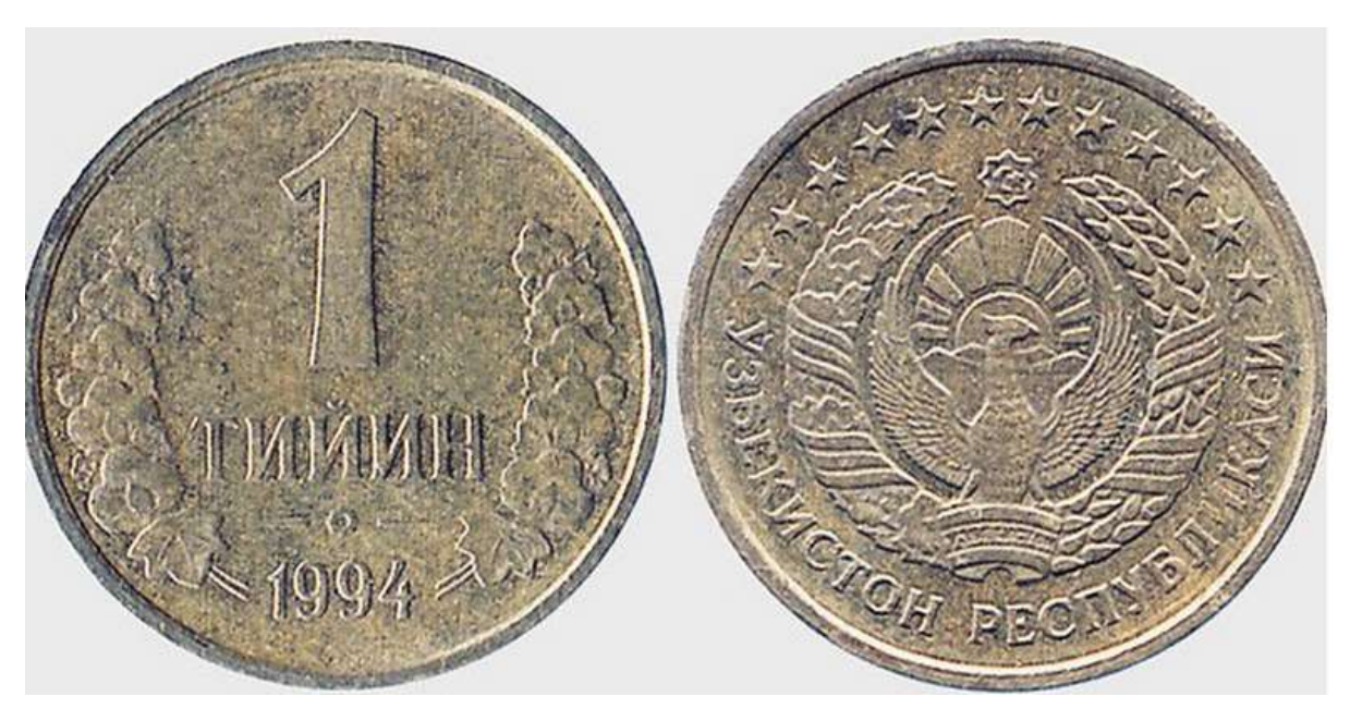
Small Change – Uzbekistan's 1 Tiyin, 100<sup>th</sup> of a Som

These include Tanzania where it takes 494 five-cent coins just to make the value of a UK penny or the Burmese Pya where there are 1,300 to the penny. The winner in the small change stakes however is the Uzbekistani Tiyin where you would require 3,038 to equal the value of a penny. That's roughly 2,000 to the Australian cent!